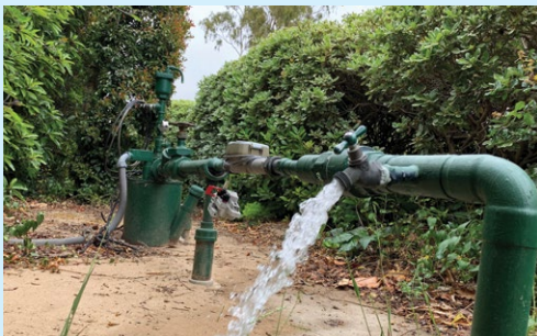
Groundwater wells, source from the Montecito Groundwater Basin.