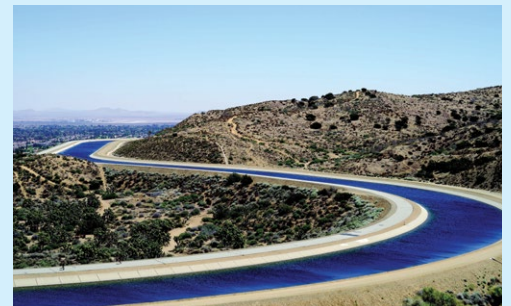
State Water Project & Supplemental Water Purchase.