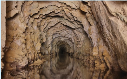
Doulton Tunnel, a horizontal well, source of groundwater and conveyance from Jameson Lake.

RELIABLE SINCE 1921 www.montecitowater.com