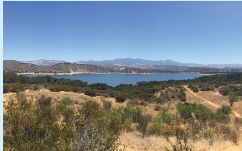
Cachuma Project (Lake Cachuma), a federally owned surface water facility.