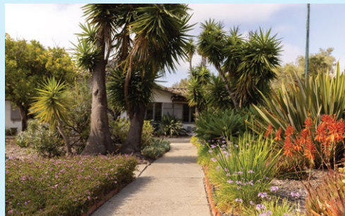
Conservation - Water efficiency.