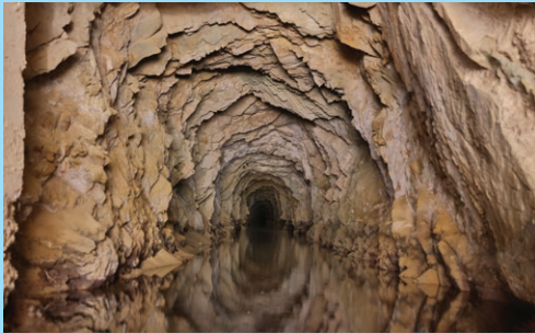
Doulton Tunnel, a horizontal well, source of groundwater and conveyance from Jameson Lake.

RELIABLE SINCE 1921 www.montecitowater.com