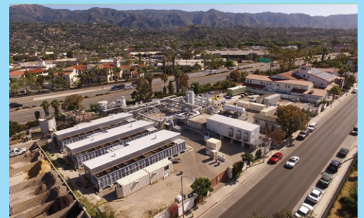
Water Supplied by the City of Santa Barbara, secured by Charles E. Meyer Desalination facility.