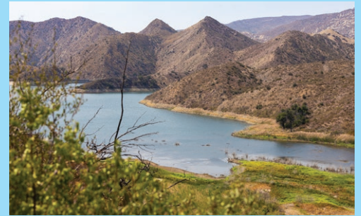
Jameson Lake, a District owned surface water facility.