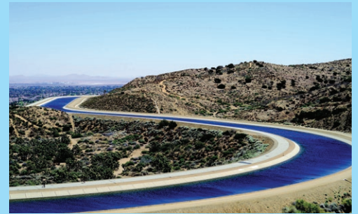
State Water Project & Supplemental Water Purchase.