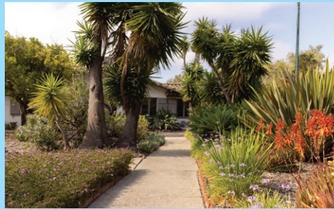
Conservation - Water efficiency.