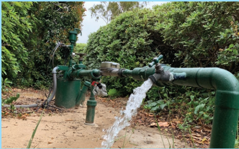
Groundwater wells, source from the Montecito Groundwater Basin.