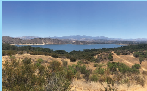
Cachuma Project (Lake Cachuma), a federally owned surface water facility.